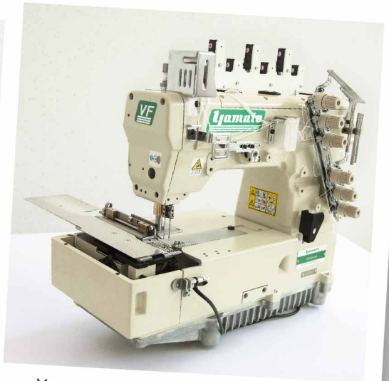
» Yamato 3 needle chain stitch sewing head